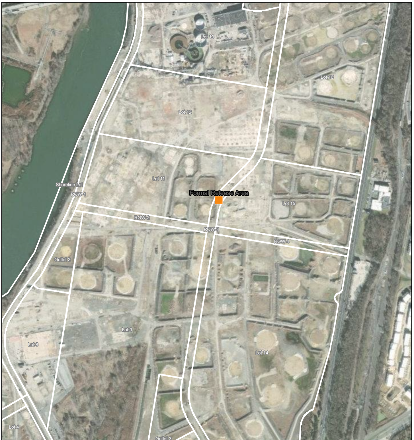
Figure 1 - Right-of-Way- 3 (ROW-3) Release on 6/22/23 Area