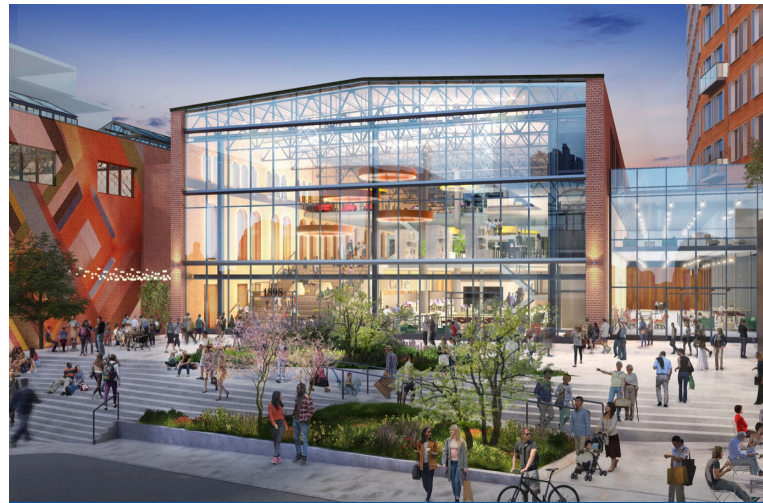
Hilco Redevelopment Partners is committed to the adaptive reuse and rehabilitation of portions of the existing buildings to preserve the site's history and character.