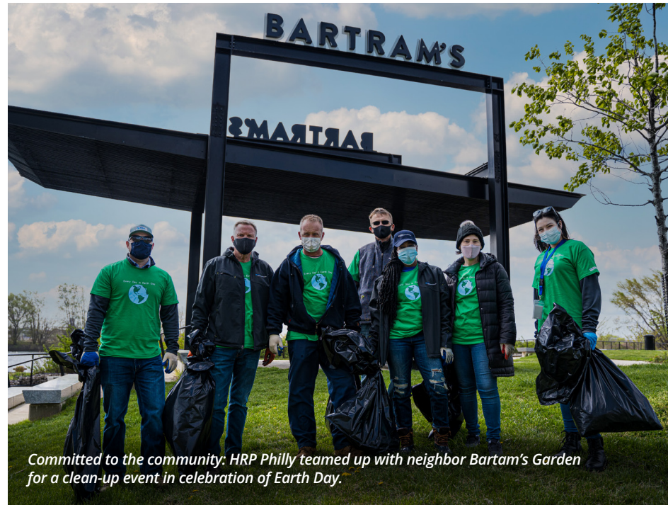
Committed to the community: HRP Philly teamed up with neighbor Bartam's Garden for a clean-up event in celebration of Earth Day.