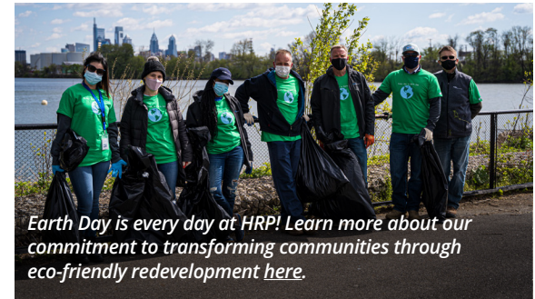
Earth Day is every day at HRP! Learn more about our commitment to transforming communities through eco-friendly redevelopment here .