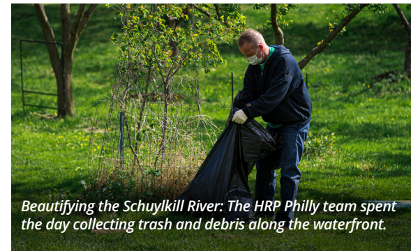
Beautifulizing the Schuylkill River: The HRP Philly team spent the day collecting trash and debris along the waterfront.