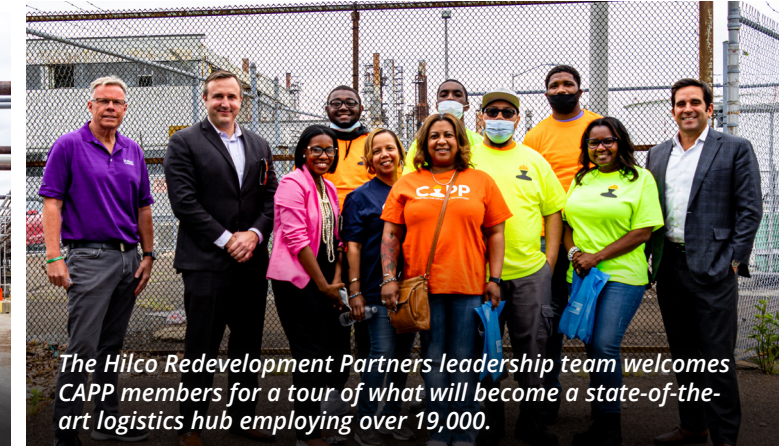
The Hilco Redevelopment Partners leadership team welcomes CAPP members for a tour of what will become a state-of-the-art logistics hub employing over 19,000.